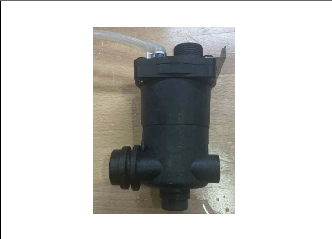
Figure 1 Air Vent